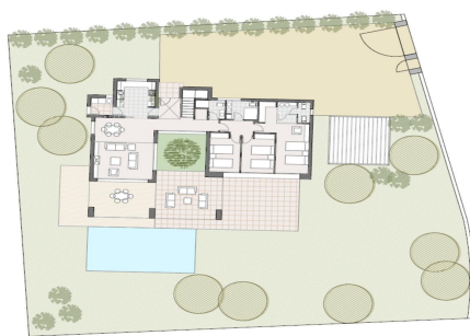
Ejemplo de implantación en parcela B3. Example setup in plot B3