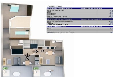
Áticos Estudio B y Vivienda A