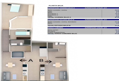
Planta Baja. Estudio B y Vivienda A