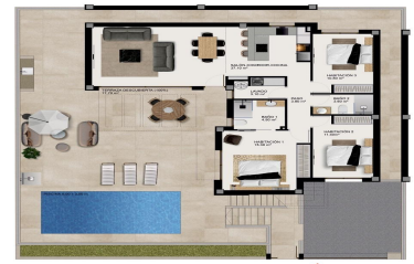
PARCELA 1 Build: 118.00 m 2 Max. Construction Plot Size: 293.00 m 2 Max. Construction Height: 12.00 m

New-build villas for sale in Benijofar, near Ciudad Quesada&#13;&#13;A prime location on the Southern Costa Blanca&#13;Discover this exclusive development of just 9 detached villas situated in Benijofar, right next to Ciudad Quesada, in the sought-after area of Atalaya Park. This peaceful residential neighbourhood offers the perfect balance between tranquillity and convenience, with supermarkets, restaurants, cafés and essential amenities just a stone's throw away. Benijofar is a charming Spanish town known for its relaxed lifestyle, whilst nearby Ciudad Quesada offers an international atmosph...(Ask for More Details!)