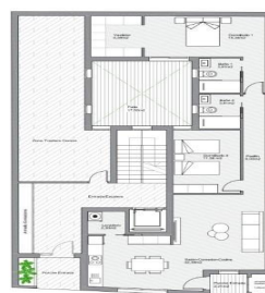
Ground Floor Apartment G-A

Total built area: 101.40m 2 2 bedrooms 2 bathrooms