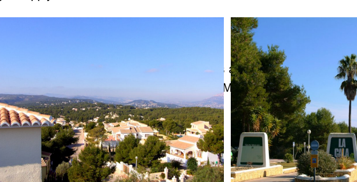
☐ PlotØ Javea

A project that meets today's requirements for modern living, including lighting, sewerage, underground electrification, water supply, underground telephone network and central gas supply.